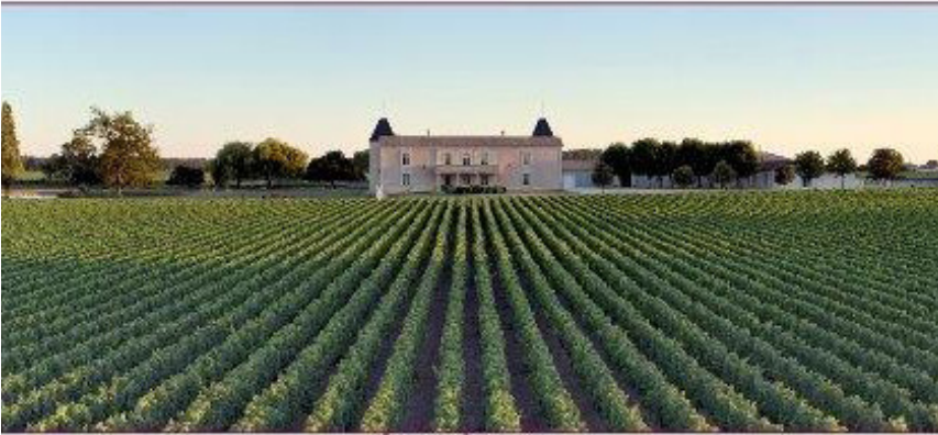
Château Haut Barrail LES BOISSELS • BÉCADAN • MÉDOC

Located in Bégadan in the northernmost section of Médoc in Bordeaux, Château Haut Barrail sits on the 5 hectares of calcareous clay soils gently sloping into the right bank of the Gironde River. Now in its 7th consecutive century producing quality wine on the left bank of Bordeaux, Château Haut Barrail was established in 1362. The only remnant of the original property is the wind-